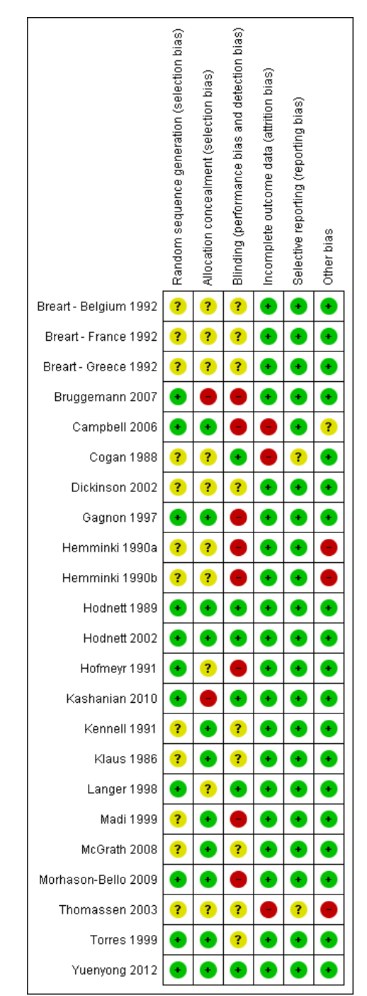
Figure 1. Methodological quality summary: review authors' judgements about each methodological quality item for each included study.